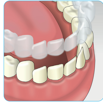
Clear Aligner Treatment

Calibrated blade thickness from 0.1 mm to 0.5 mm