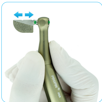
Profin PDX with IPR Tip

The solution consists of Interproximal Reduction (IPR) tips together with the reciprocating Profin PDX handpiece.